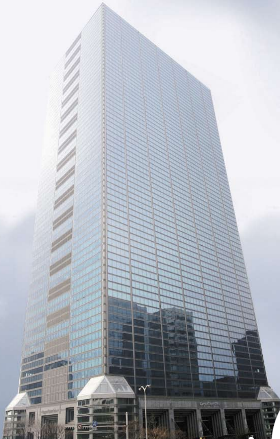
Water supply 6 Grundfos Hydro 2000 MF pressure boosting systems featuring CR32 and CR8 in-line pumps 2 CR multistage in-line pumps