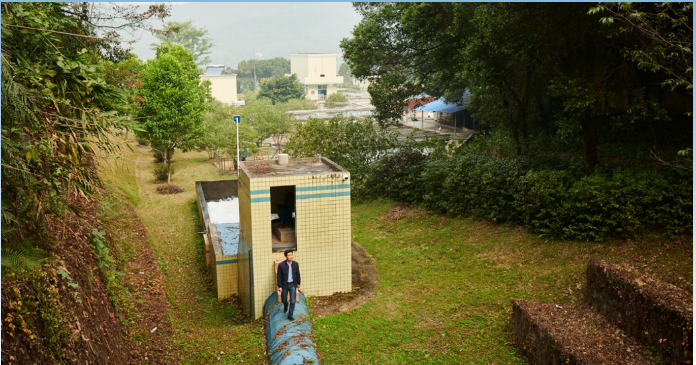
The Qujiang Water Supply Management company could no longer meet the needs of urban development in Shaoguan. It is doubling its capacity and has renovated two of its pumping stations to cope.

high. The motors were in overload status much of the time, wasting energy and placing the system operation in danger of breakdown.