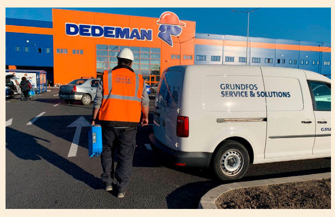
A Grundfos Service technician on the way into a biannual fire protection service check at a Dedeman store – Romania's largest retailer of DIY home improvement products.

"If we are talking about pumps for heating or water supply, then the impact in case of problems is not so huge. Okay, we