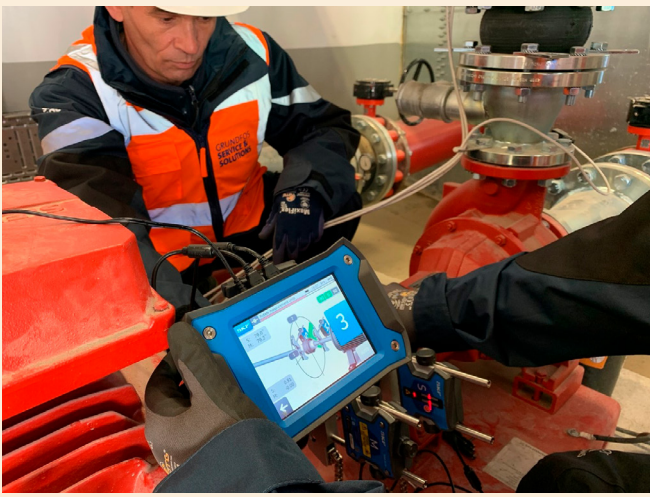
A laser alignment tool helps to make sure the pump motor shaft is in line on the Grundfos fire pumps.

"This recommendation is the most important step," he says. "In many cases, we discover small things that must be replaced, parts with too much wear, or components that are too old or are not working properly. We recommend what needs to be done for the person or the team taking care of the system on a daily basis."