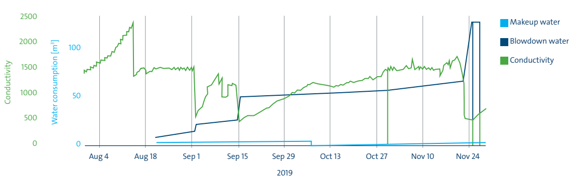
Inefficient manual Blowdown control on site

According to the facility manager, the company also struggles with time consuming legal compliance reporting. The logging and tracking of data are done manually, which wastes a lot of time and creates a risk of inaccurate reporting.