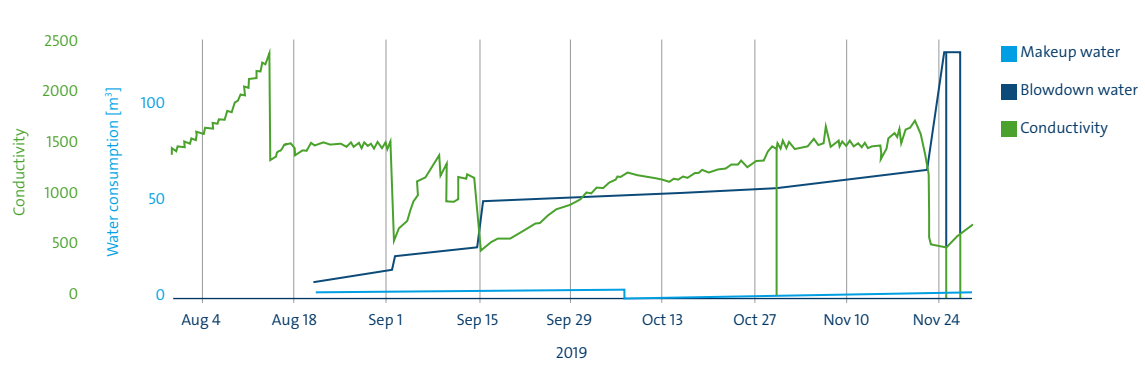
Inefficient manual Blowdown control on site

According to the facility manager, the company also struggles with time consuming legal compliance reporting. The logging and tracking of data are done manually, which wastes a lot of time and creates a risk of inaccurate reporting.