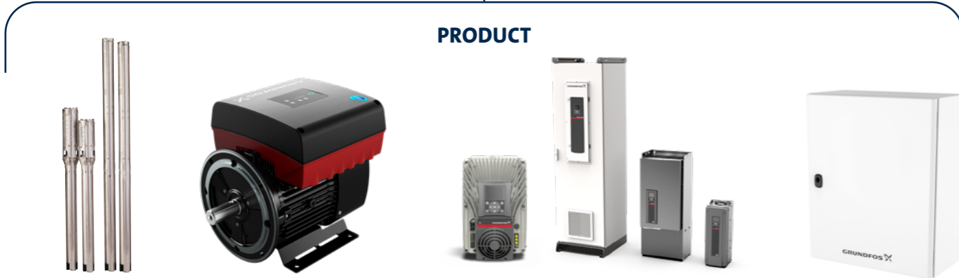
SQFlex submersible pump