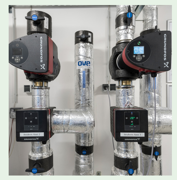
Mixing loops for building phase 1 (right) and 2 (left), each with MIXIT control unit and MAGNA3 secondary circuit pump.

OVE sees the online access to many data points as a huge advantage. "As a contracting business, it is important for us to be able to constantly monitor the operation of the mixing loop and optimise it as needed," observes Grafe. "A mixing loop with individual components requires a separate controller. This comes at a considerable cost and effort but in the end all it does is control the mixer. With the Grundfos solution, the control unit gives us control over many more data points as well as access to pump operation. This enables us to continuously monitor the operating times, volume flow, speed and energy consumption of the pump. The control unit gives us full control over the entire mixing loop operation at all times."