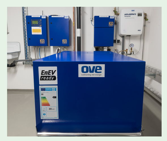
The main heat generator is a compact CHP system with 21 kW of thermal and 9 kW of electrical output.