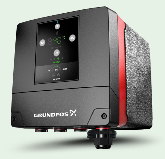
MIXIT control unit with integrated valves, stepper motor, temperature and pressure sensors, and intelligent temperature control.

The first OVE project with the latest generation of mixing loop solution is a residential estate near the company's location, which serves as a reference property for the contractor. The property consists of eight housing units completed in mid-2021 in the first construction phase, with another eight units in a separate building to be completed in the second phase. The supply technology has already been designed for all sixteen units.