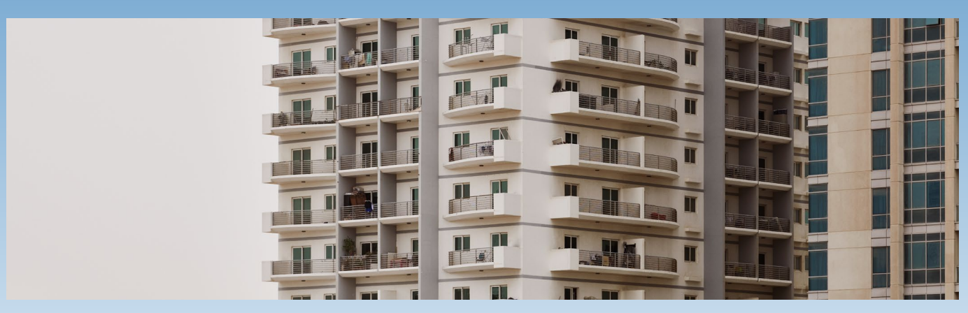
Indigo Tower, Dubailand, Dubai