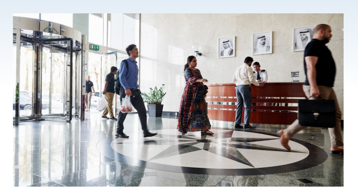
Green Tower's new HVAC pumps are using 57% less electricity for keeping the office building cool than previously after the building retrofit.

"All we need to do is get to them and almost open the valve," he says. "It's not hopes and dreams or something that's not feasible. It's right there, and it's very simple to achieve."