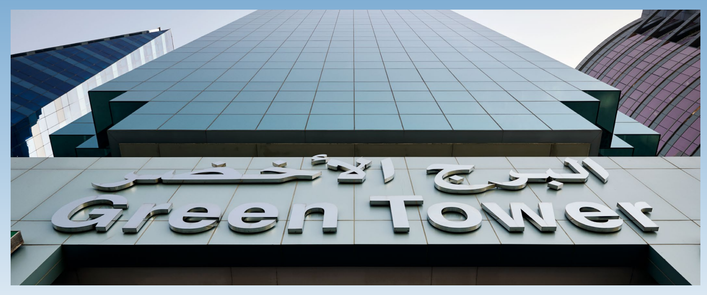
Green Tower, Deira, Dubai