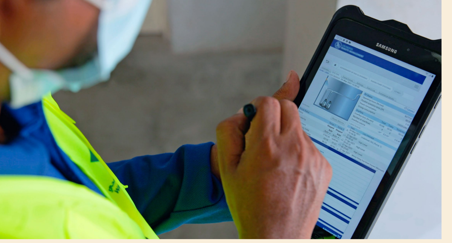
The remote management system from Grundfos allowed RAKWA to monitor its remote stations through tablets, smartphones and desktops, limiting the need to do physical visits.