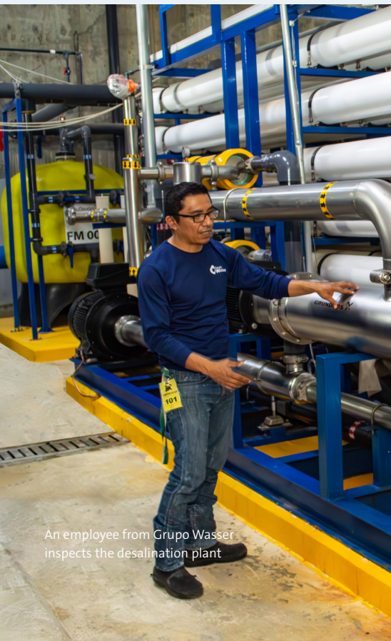
An employee from Grupo Wasser inspects the desalination plant