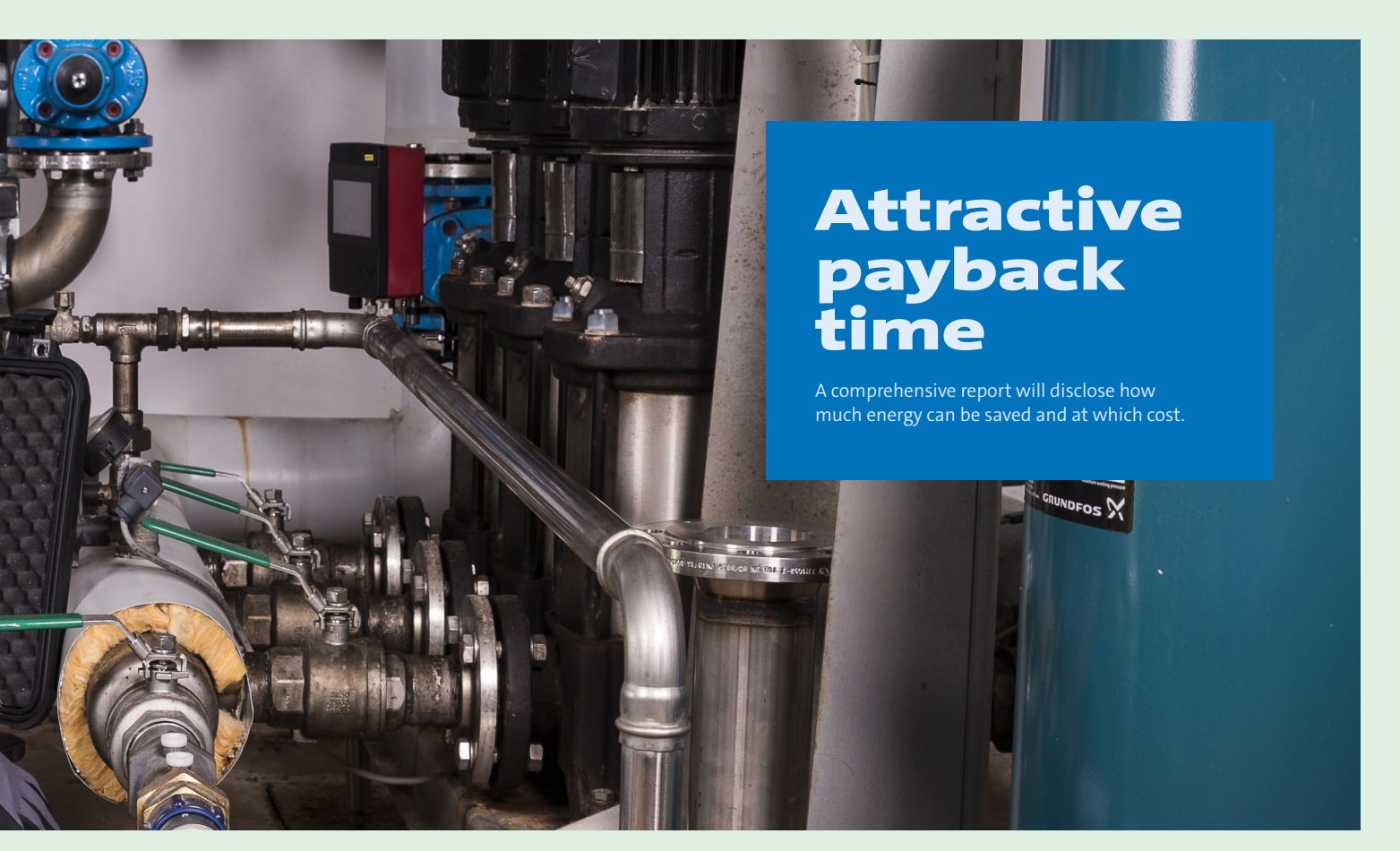
The energy optimization process will mostly take place in utility rooms and will not disturb your operations.

In an Energy Audit, measuring equipment is attached to the pump and surrounding pipe work and left to monitor the activities of the pumping system during a relatively short and well-defined period. This data is stored on a data logger and inputted into a diagnostic tool developed by Grundfos, specifically designed to identify excessive energy consumption in any kind of pumping system. The result lets you compare the energy consumed by your present pumping system to that of a more efficient pumping system using the data collected during the monitoring period. The whole system is audited to establish the full energy saving potential.