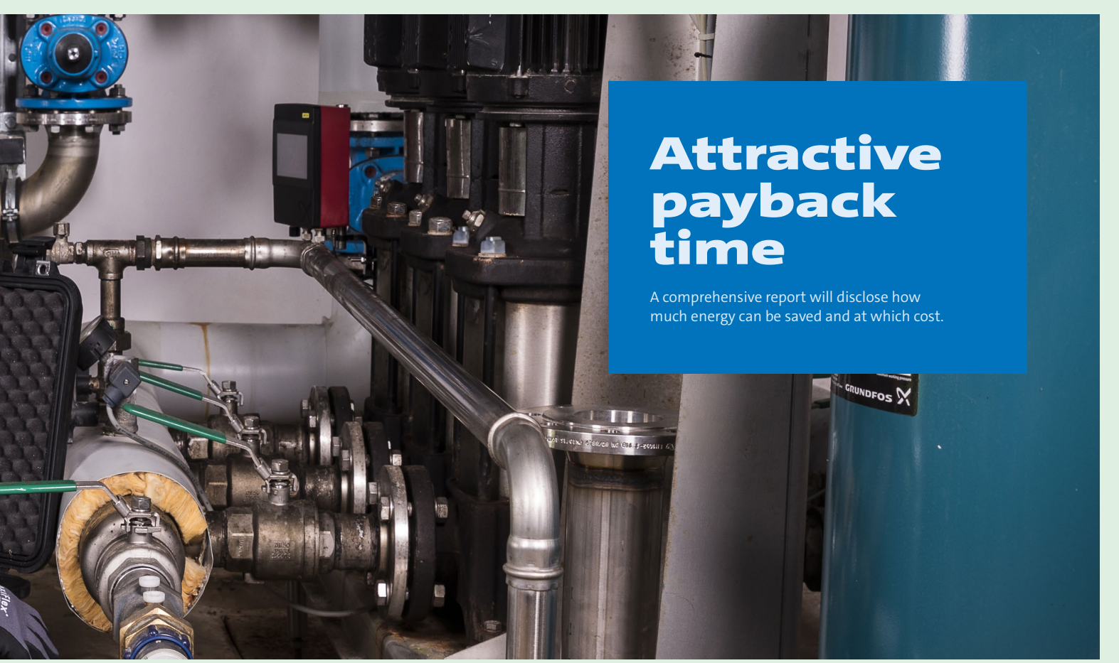
The energy optimization process will mostly take place in utility rooms and will not disturb your operations.

In an Energy Audit, measuring equipment is attached to the pump and surrounding pipe work and left to monitor the activities of the pumping system during a relatively short and well-defined period. This data is stored on a data logger and inputted into a diagnostic tool developed by Grundfos, specifically designed to identify excessive energy consumption in any kind of pumping system. The result lets you compare the energy consumed by your present pumping system to that of a more efficient pumping system using the data collected during the monitoring period. The whole system is audited to establish the full energy saving potential.