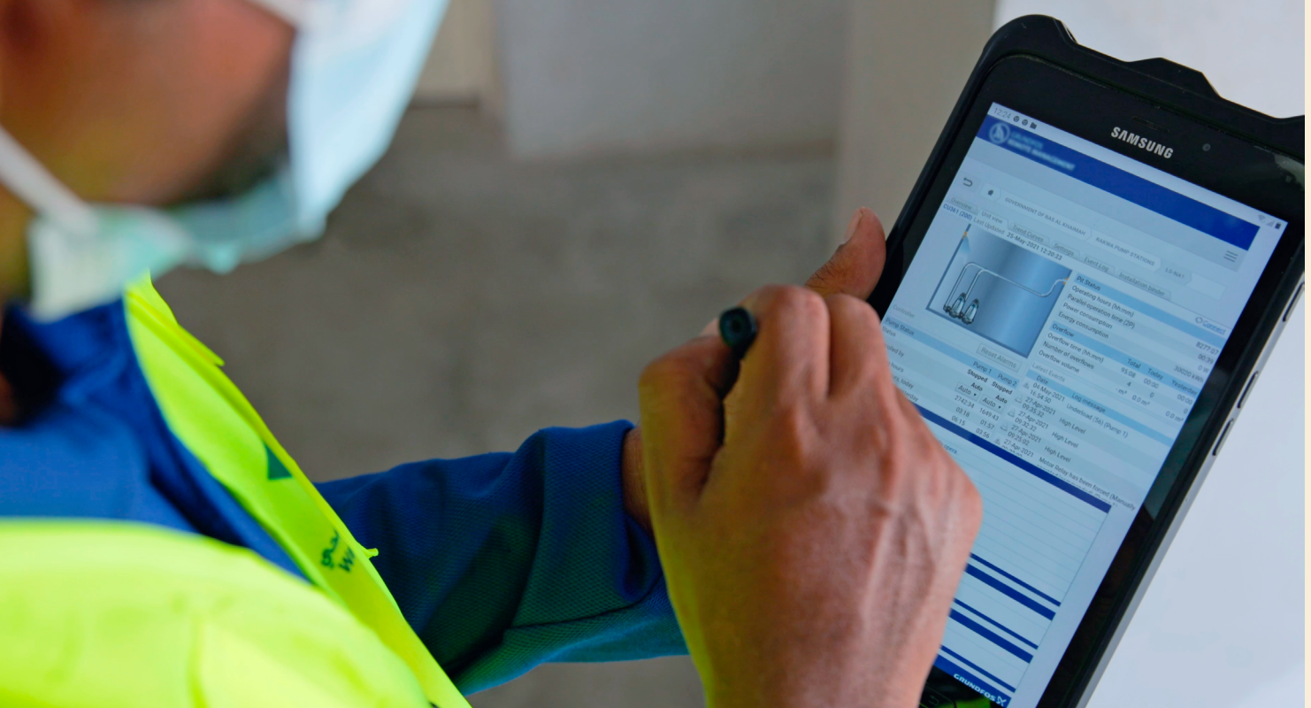
The remote management system from Grundfos allowed RAKWA to monitor its remote stations through tablets, smartphones and desktops, limiting the need to do physical visits.